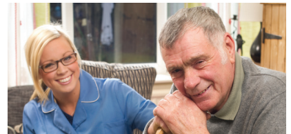
Source: American Association for Long-Term Care Insurance, 2012 LTCI Sourcebook